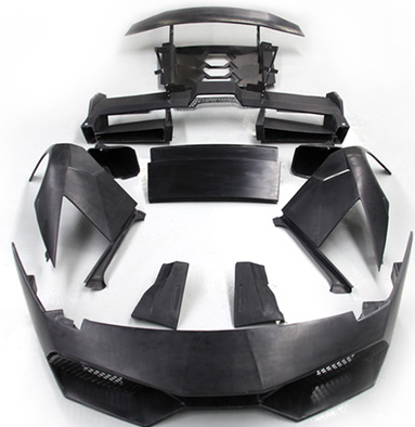
MURCIELAGO > LP670-4