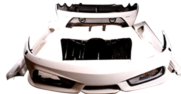
F430 > F430 SCUDERIA